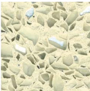
Mondéco Crystal Ice Oyster White