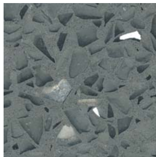
Mondéco Crystal Ice Dusty Grey