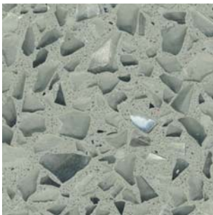
Mondéco Crystal Ice Agate Grey