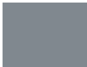
Dark Grey (close to RAL 7046)

The applied colours may differ slightly from the examples shown above. Contact our customer services for a true colour sample.