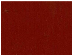
Red (close to RAL 3009)